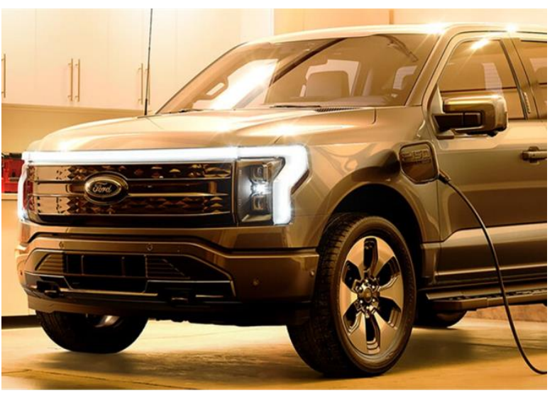
"Do our part to meet the global climate challenge."

--Port of Tacoma 2021-2025 Implementation Plan